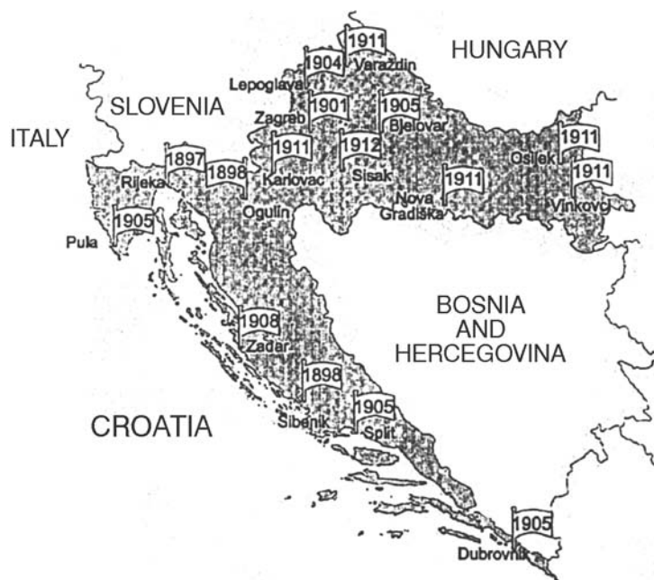
Very first Roentgen apparatus have been installed in Croatian hospitals at the end of 19th and beginning of 20th Century.