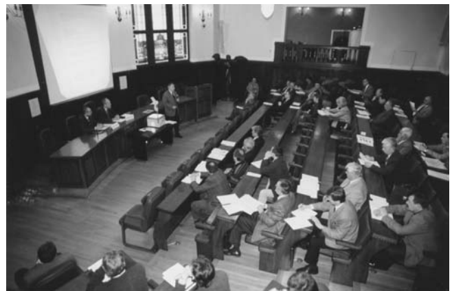
The discussion on the manufacturing for car industries particularly attracted interest of managers of small and medium companies.

Eight additional discussions are planned to be held during this year. They will deal with the manufacturing of building materials, the wood processing and manufacturing of furniture, tools manufacturing, etc. The participants will also discuss the application of digital technologies in the printing industry.