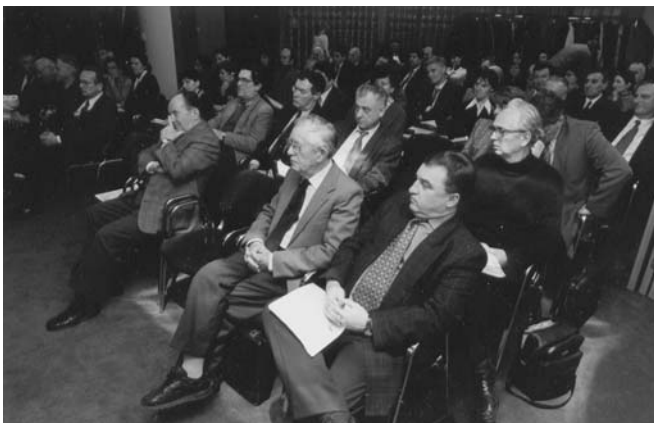
On the discussion on polymers academics, managers and industrial engineers have gathered to debate broad spectrum of actual questions.

The discussion on polymers has brought together academics, managers and industrial engineers to debate a broad spectrum of important questions.