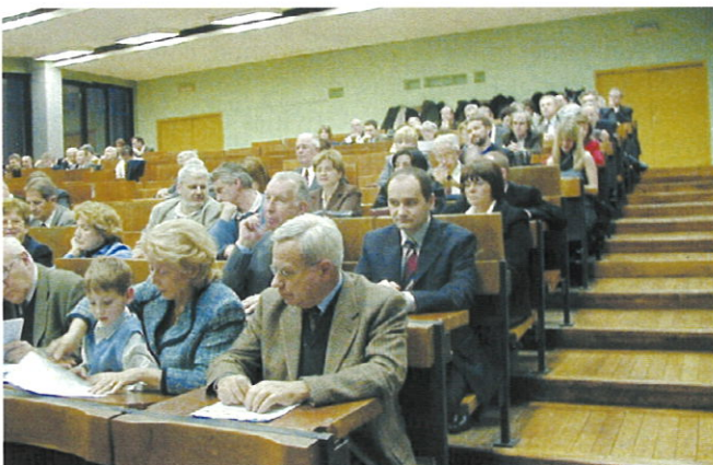
Assembly in session