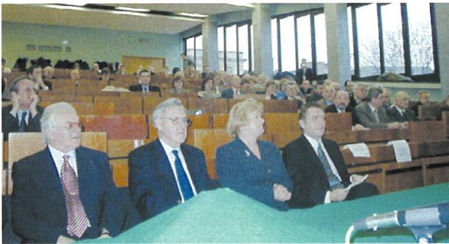
Distinguished guests of the Assembly

The Agenda of the Assembly included the Report on the Activities of the Governing Board of the HATZ 2003-2005, Programme of Activities and Financial Plan of the HATZ for 2005 and the procedures of passing these documents.