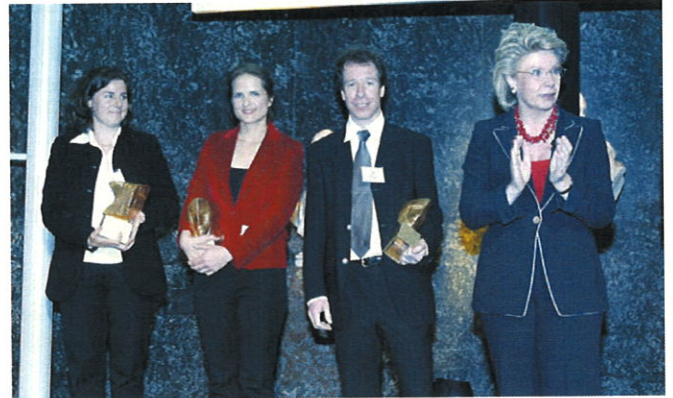
Winners of the Awards with Viviane Reding, the EC Commissioner for the Information Society and Media

of implants and grafts in knee replacement and anterior cruciate ligament surgery.