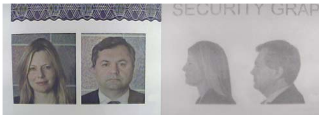
An example of INFRAREDESIGN pictures (RGB and Z)

been proven that there is no correlation between Z, R, G and B values. This means that we can create an infinite number of RGB colors with same Z and same RGB color tones for different Z.